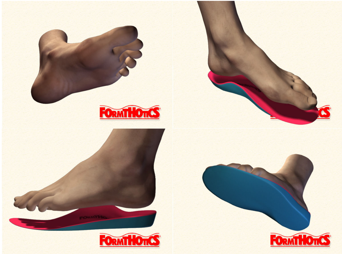
Sample frames from the final 30 second animation

The final animation was well received by the client and was used as part of an interactive kiosk at an international tradeshow in Germany and is also due to feature in a TV commercial.